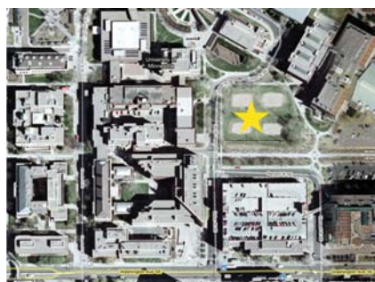
A satellite image of the two-acre site of the proposed Physics and Nanotechnology Building, which lies between the Washington Avenue Parking Ramp and the Civil/Mechanical Engineering Building, just north of the Scholar's Walk.

The Regents will vote on the capital request in October, and it will be considered by the Legislature at their session beginning in February. New facilities to support expansion in experimental physics research are crucial for the future of the School and will deliver great benefit to the University and the state. All members of the community of the School, including alumni, current students, staff, faculty, and friends can help make the new building a reality by expressing enthusiastic support to your friends and elected representatives.