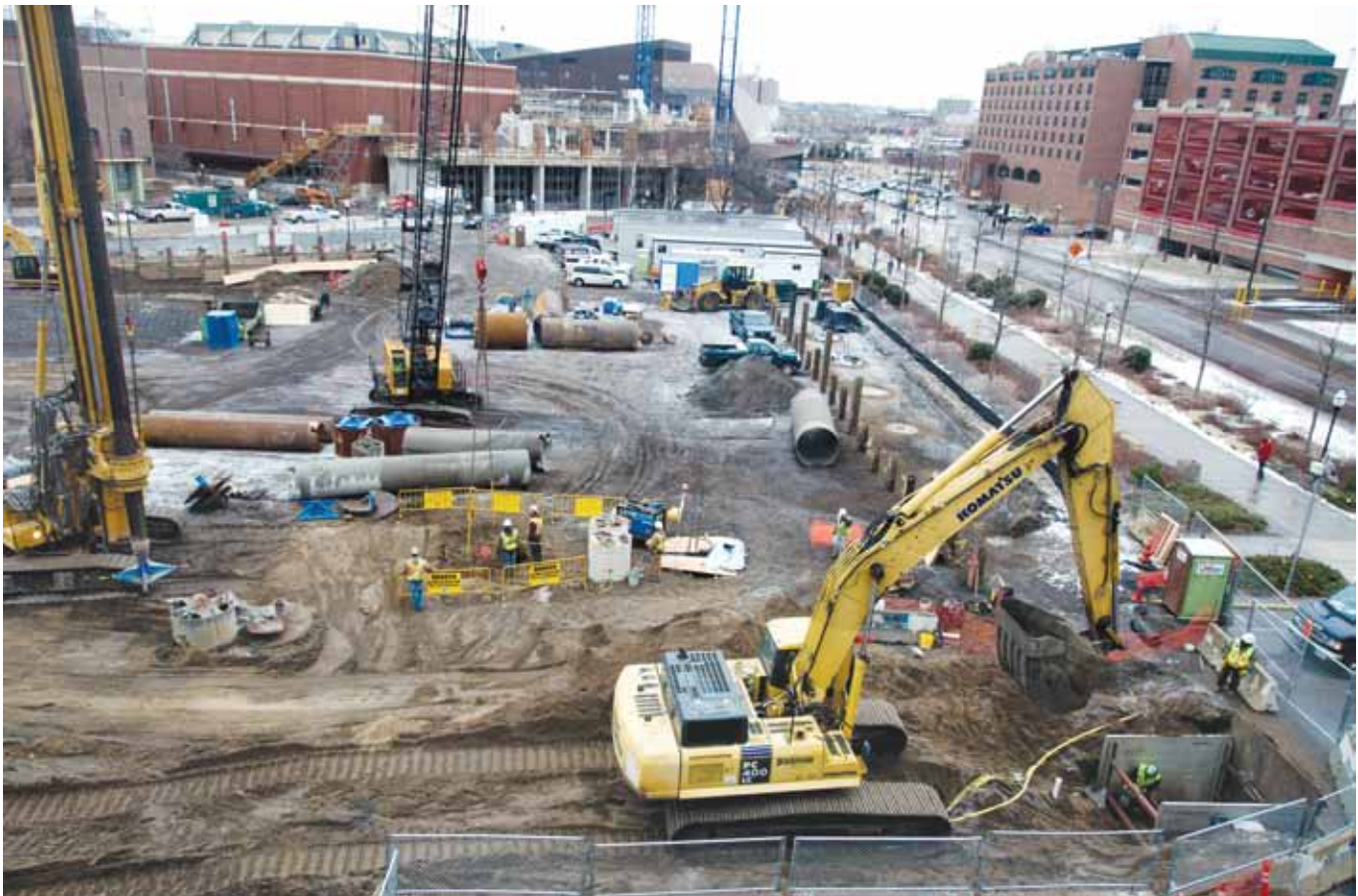
Construction is well under way on the corner of Beacon Street and Union. You can monitor progress on the building on our web cam [ cse.umn.edu/research/physicsnano/webcam/index.php ]