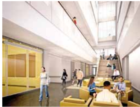
Above: architects rendering of the Physics and Nanotechnology building, approaching from the South. Left: rendering of the atrium looking east.